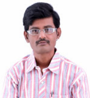
MY PHOTO.jpg 25K